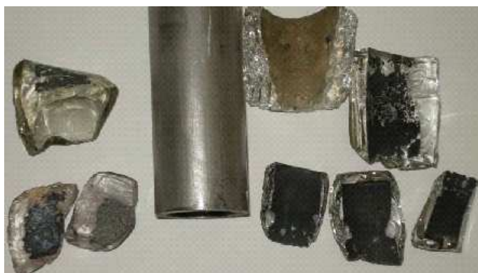
Moils excavated from a Dublin glasshouse (left) compared with some produced using 'musket barrel' blowing irons (right). The tube outside diameter is approximately 22mm

Archaeological evidence was however rather more helpful, and analysis of some moils (remains of the glass from the end of the blowing irons, also called 'rod-end cullet') excavated from a late 17th C glasshouse in Dublin confirmed that these vessel-glass pipes were made of iron (from the iron-scale remaining on the glass) with an external diameter of about 22mm. They were not flared or flanged and indications are that the wall thickness was around 2.5mm.