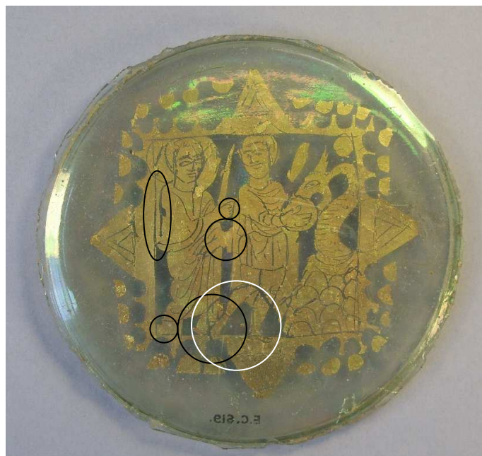
Gold glass inventory number 1863.7-27.1 in the British Museum collection, highlighting (in black) five areas of excess gold leaf which have not been removed; and (in white), the accidentally scored surface of the gold leaf.

The medium known commonly as 'Late Antique gold glass' dates to the fourth century AD and is found predominantly in the form of vessels in the catacombs of Rome. In each instance, images depicting subjects such as secular people, saints and biblical episodes, as well as pagan and Jewish images, appear executed in gold leaf and effectively sandwiched between two layers of glass. The images appear on the base of the vessel and, most often, it is only the decorated base-disc that has survived. The walls have usually, and often deliberately, been carefully trimmed away.