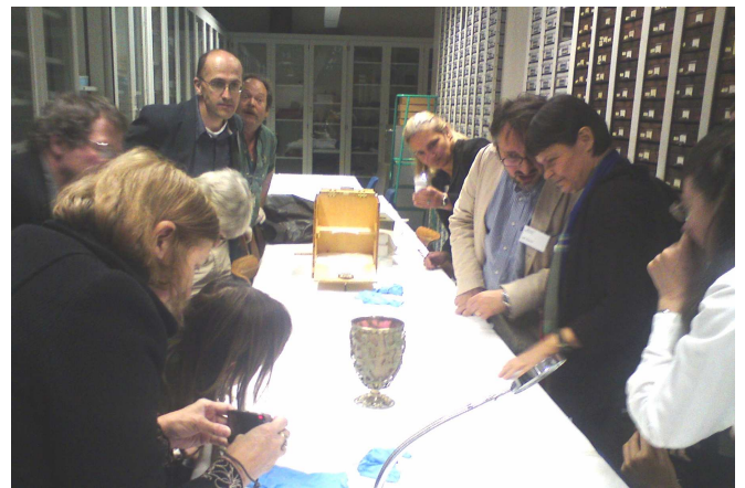
An appreciative crowd around the Lycurgus cup