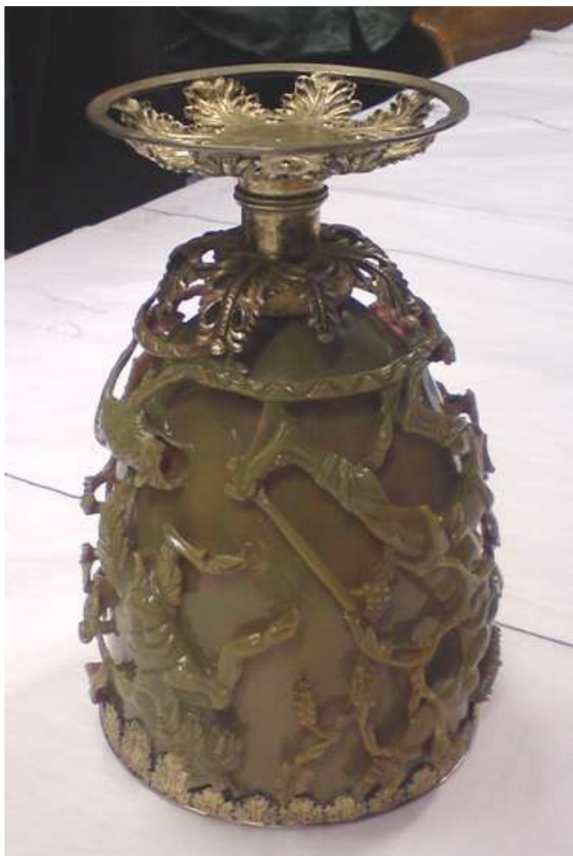
The Lycurgus cup, during a viewing as part of the recent conference at the British Museum (see page 4)