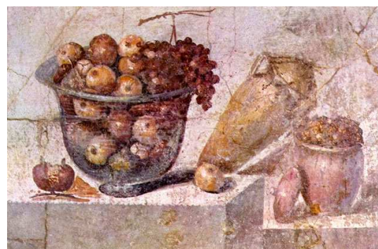
A still-life fresco from the House of Julia Felix, Pompeii

Receipts may be sent by email or with an SAE. Participants from outside the UK may pay upon arrival at the venue in UK sterling. Refunds will not be given for cancellations within two weeks of the meeting.