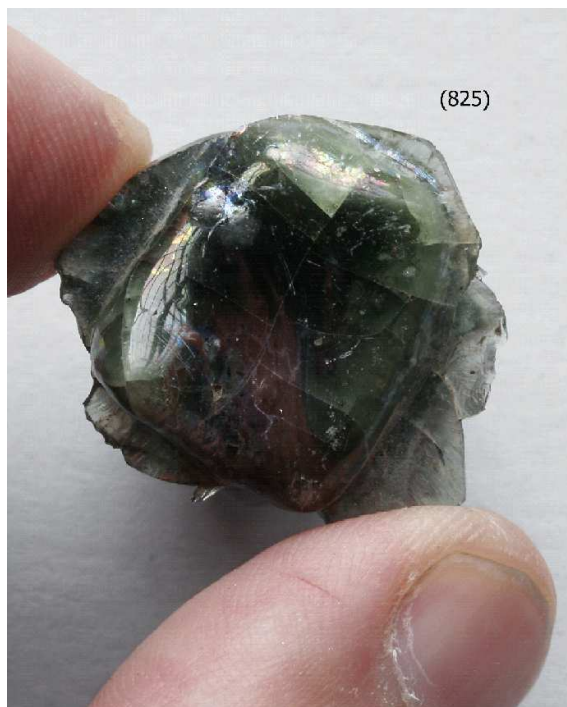
A piece of glass waste from Canterbury

archaeological context, will be forthcoming in the conference proceedings.