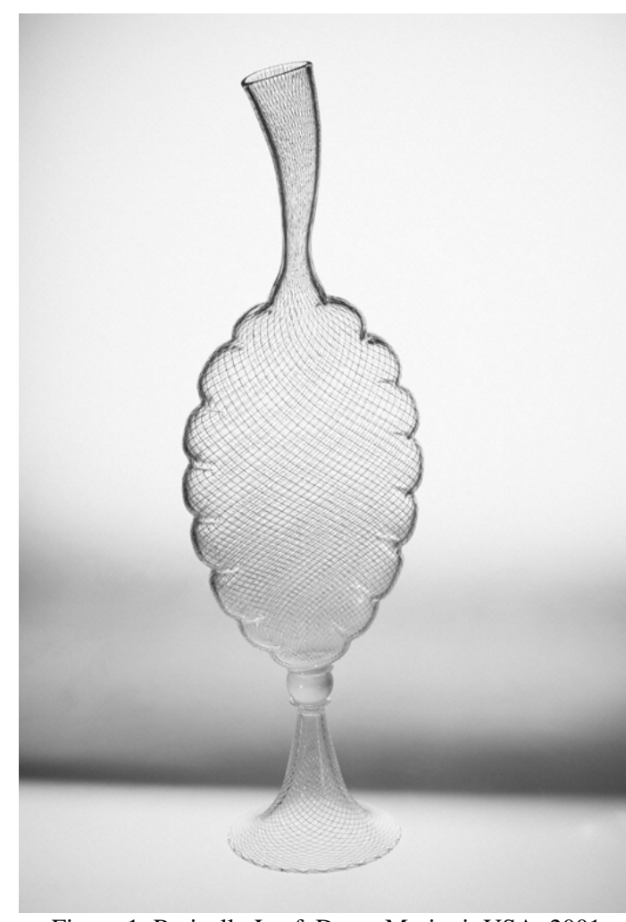
Figure 1: Reticello Leaf, Dante Marioni: USA; 2001 (Museum No. C.156-2003).

The popularity of film within the gallery has been thoroughly proved but, rather than run it continuously, it is likely that a planned programme may be installed. Use of the gallery will change as the makers' needs, and educational and information technology evolves.