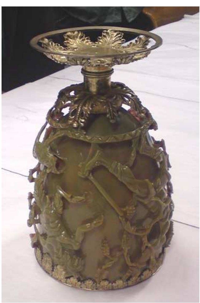
The Lycurgus cup, during a viewing as part of the recent conference at the British Museum (see page 4)