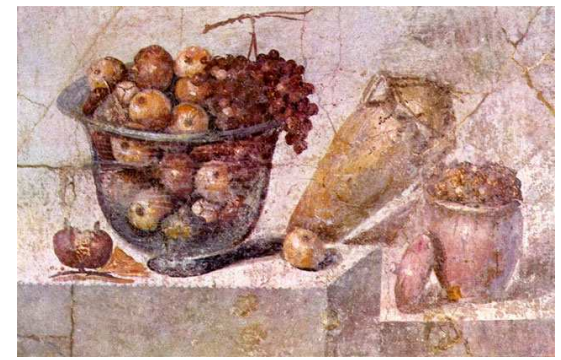
A still-life fresco from the House of Julia Felix, Pompeii

Receipts may be sent by email or with an SAE. Participants from outside the UK may pay upon arrival at the venue in UK sterling. Refunds will not be given for cancellations within two weeks of the meeting.