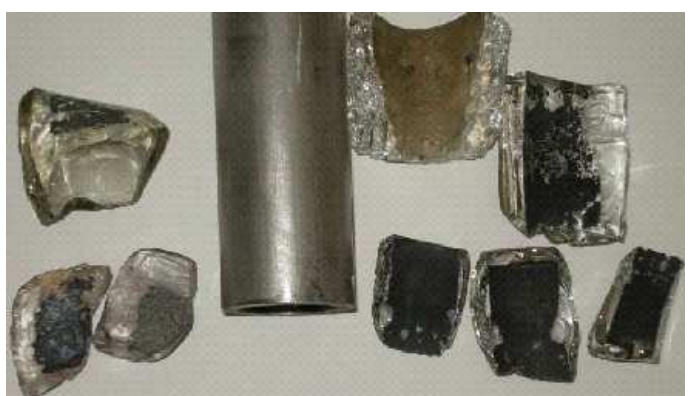
Moils excavated from a Dublin glasshouse (left) compared with some produced using 'musket barrel' blowing irons (right). The tube outside diameter is approximately 22mm

Archaeological evidence was however rather more helpful, and analysis of some moils (remains of the glass from the end of the blowing irons, also called 'rod-end cullet') excavated from a late 17th C glasshouse in Dublin confirmed that these vessel-glass pipes were made of iron (from the iron-scale remaining on the glass) with an external diameter of about 22mm. They were not flared or flanged and indications are that the wall thickness was around 2.5mm.