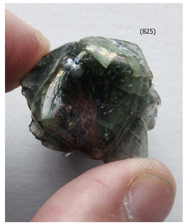
A piece of glass waste from Canterbury

archaeological context, will be forthcoming in the conference proceedings.